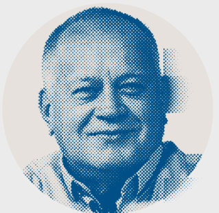
Diosdado Cabello Ministry of Interior