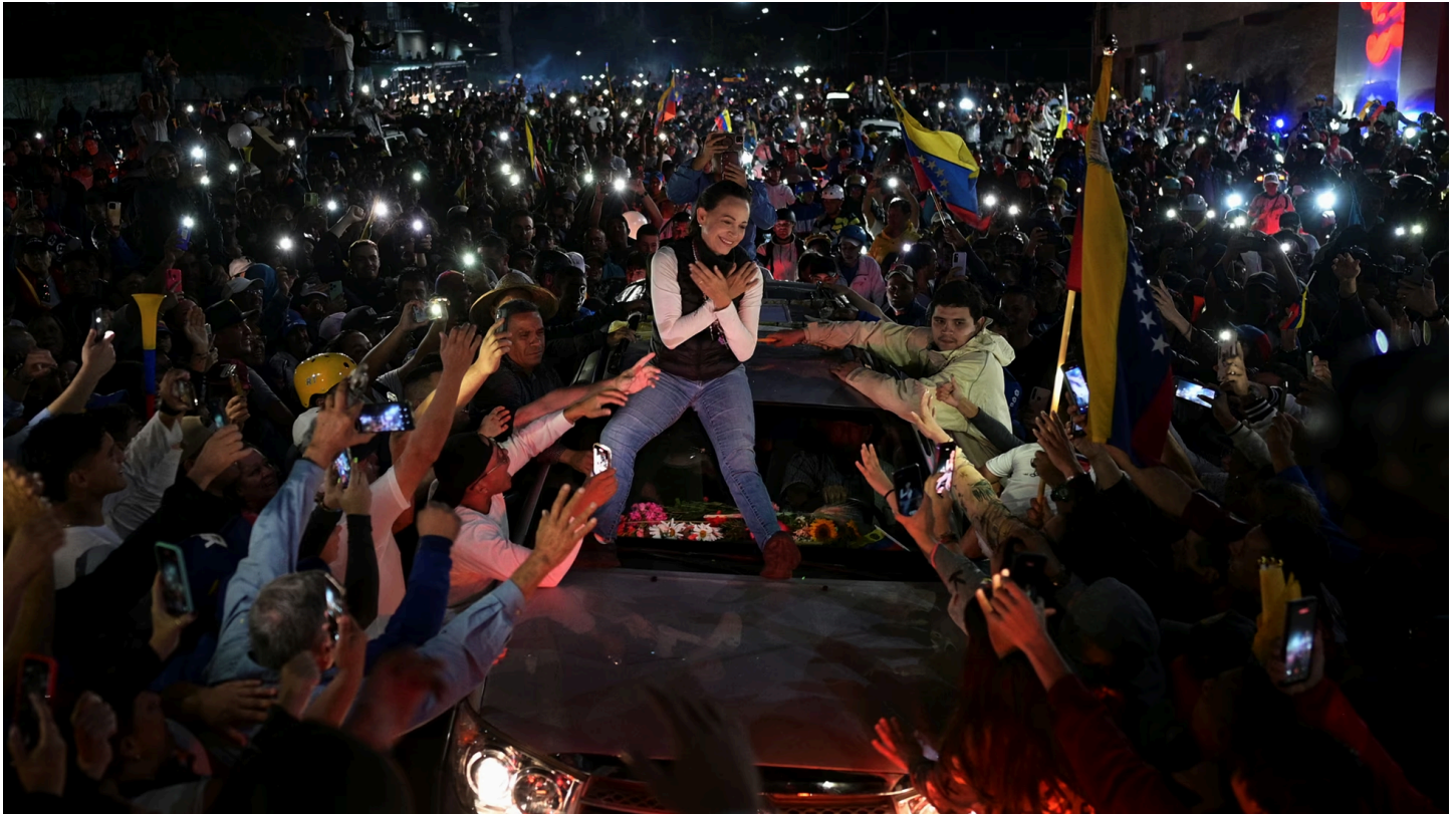
Figure 4: Photo of Venezuelan opposition leader Maria Corina Machado at a rally ahead of the 2024 presidential election

Machado has received strong support from bipartisan lawmakers in the US House and Senate, who have questioned US engagement with Rodríguez. While Machado's efforts to raise the political cost of engagement with the Rodríguez government have earned her support from some allies in Washington, the White House has reportedly expressed frustration with her criticism, with officials claiming it undermines US policy. These efforts very likely represent a lesser threat to Rodríguez's hold on power, given White House insistence on working with Rodríguez, but introduce persistent uncertainty into the sustainability of US support for her.