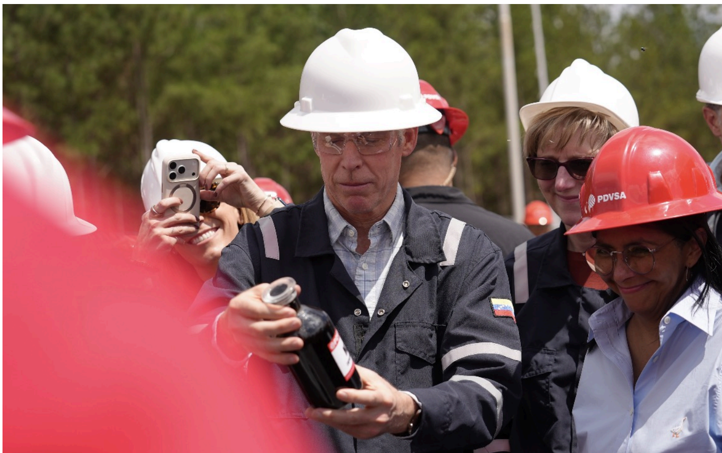
Figure 2: US Energy Secretary Chris Wright examining crude oil at a PDVSA project site with Rodríguez

In the wake of the Organic Hydrocarbons Law reform, the US Treasury Department’s Office of Foreign Assets Control (OFAC) issued a series of general licenses allowing US and other Western companies to produce, refine, transport, and sell oil without seeking individual exemptions, effectively lifting sanctions that had previously restricted these activities (see Appendix A ). These OFAC licenses mandate that any authorized transactions with Venezuela’s government or state energy company PDVSA must follow US laws (with disputes being resolved in the US), and that payments to the Venezuelan government or any other Venezuelan sanctioned entity be made into a US-overseen fund. US support for energy investment in Venezuela was emphasized from February 11 to 12, when US Energy Secretary Chris Wright led a delegation to Caracas to meet with Rodríguez, becoming the highest-ranking US official to visit Venezuela in years.