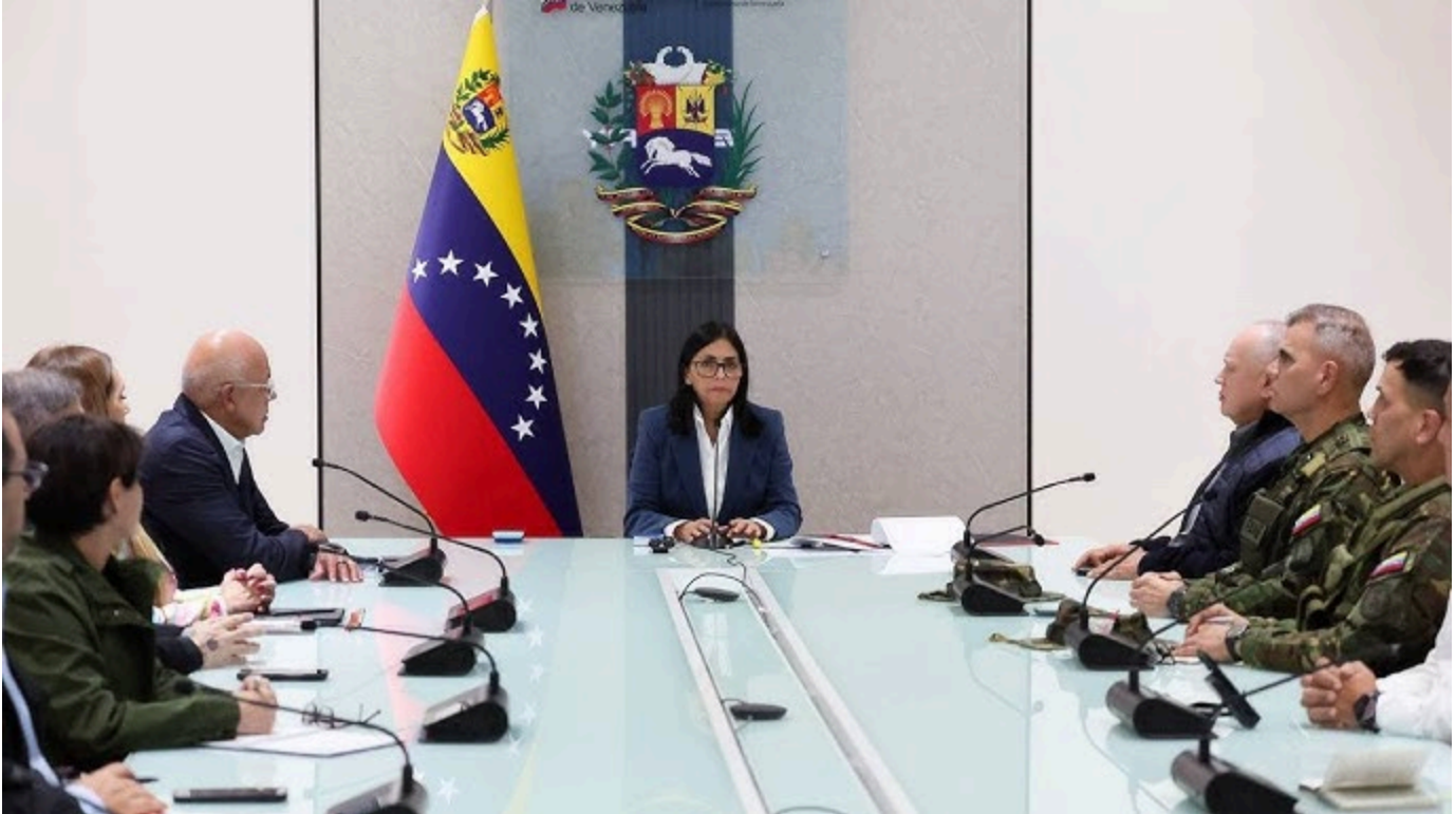
Figure 1: Venezuelan state TV broadcast showing Rodríguez presiding over a meeting of the Council of National Defense