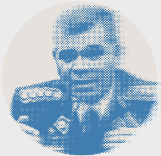
Gen. Vladimir Padrino López Former Minister of Defense