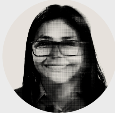
Delcy Rodríguez Consolidating Authority